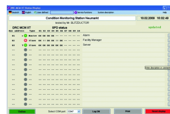
DRC MCM XT status display software

DIN rail mounted device with integrated RFID LifeCheck sensor for condition monitoring of max. ten BLITZDUCTOR XT / XTU arresters with RFID LifeCheck technology. Visual operating state indication via three-coloured LED in conjunction with remote signalling contact (break or make contact). An RS 485 interface makes it possible to connect up to 15 DRC MCM XT.