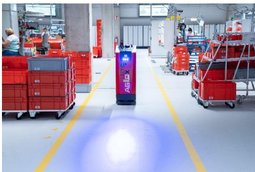
Thanks to modern ergonomics and digitalisation, the new plant offers innovative approaches to production and logistics as well as space for new, highly efficient processes and work methods.