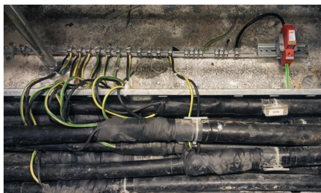
Indirect earthing of armouring and shields of cables to the technical building, to avoid disturbance by interfering voltage