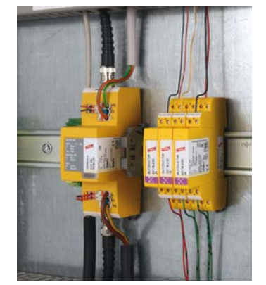
Solution with individual components